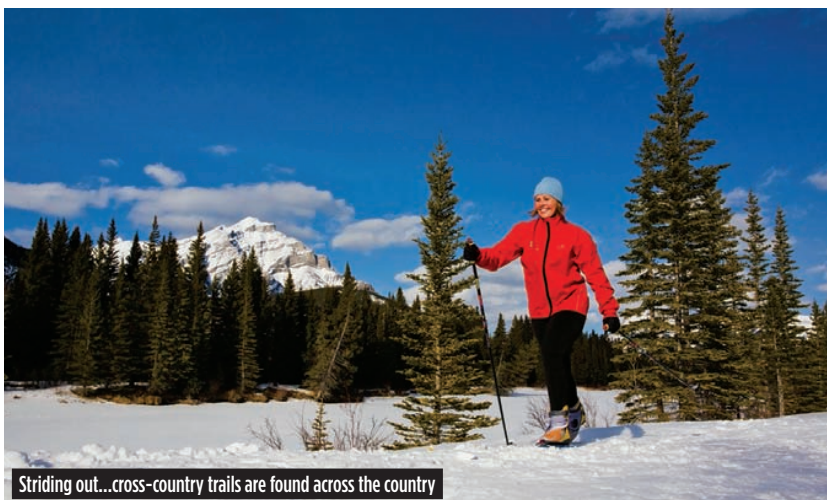
Striding out...cross-country trails are found across the country

the winter paradise of Niagara-on-the-Lake's Queen Street. "Although some of the great attractions at Niagara Falls are available year round, these can appear much more magical in winter and are generally less busy," he said.