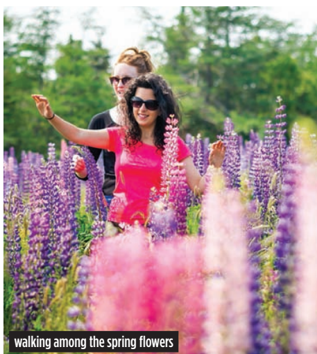
walking among the spring flowers