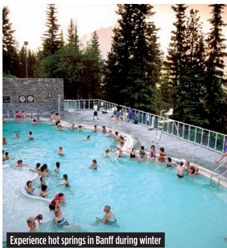
Experience hot springs in Banff during winter