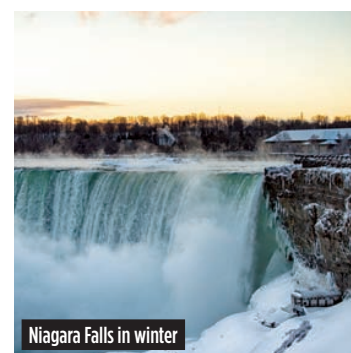
Niagara Falls in winter

For the more adventurous, try a fat bike experience, Canada's latest extreme sport craze – take a late-season cross-country ski lesson or go whitewater rafting. Alternatively, learn how to drive a dog sled or try a combination of the two where you are pulled along by a pack of huskies on your skis. ▶