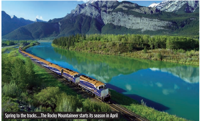
Spring to the tracks....The Rocky Mountaineer starts its season in April

► Nature lovers will enjoy spotting bighorn sheep, elk and deer in the wildflower meadows. There are also plenty of walking trails and vineyards to explore in the Thompson Okanagan region, as well as Berg Lake in Mount Robson Provincial Park and the Lake O'Hara alpine circuit in Yoho National Park.