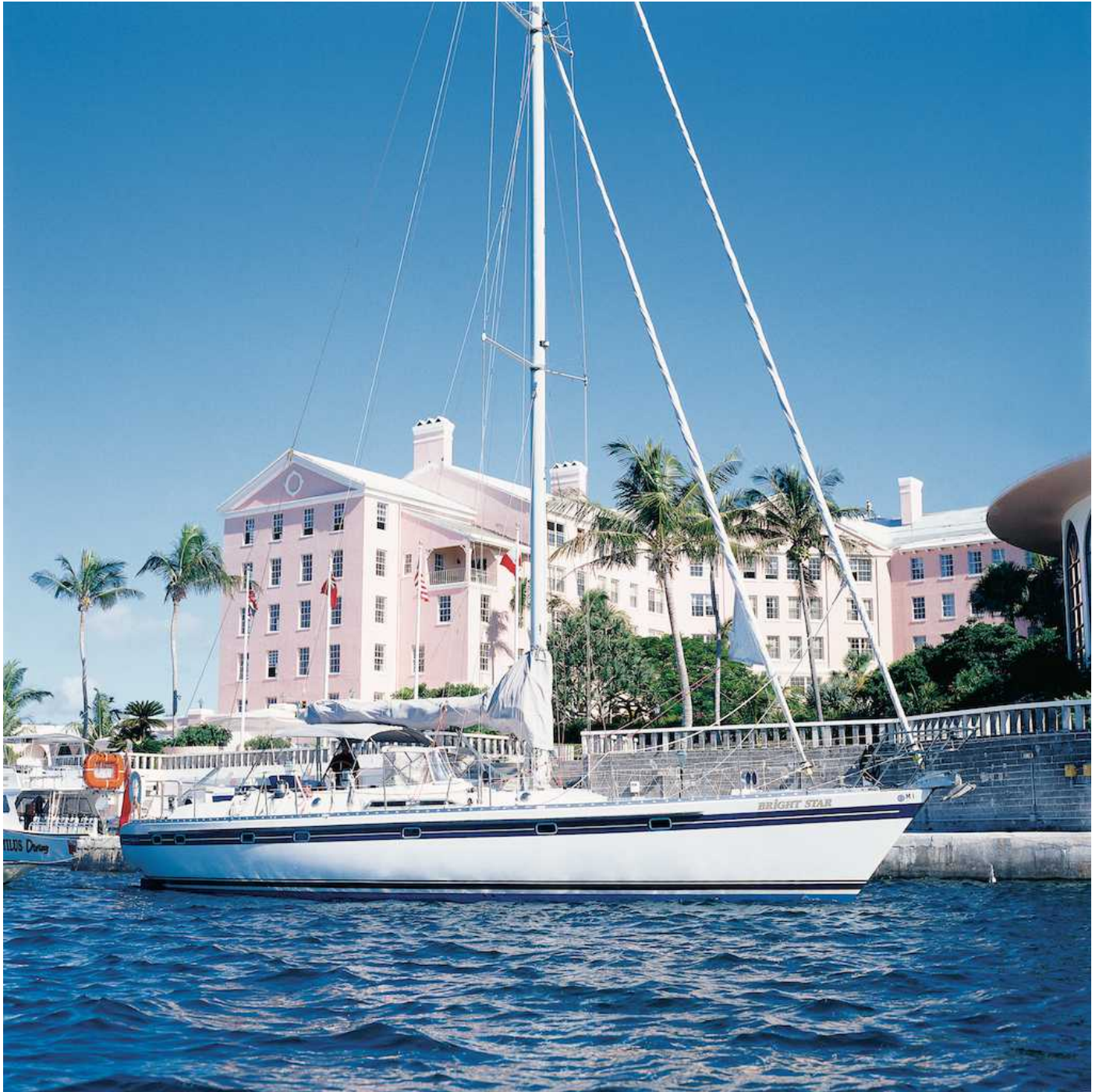
The Hamilton Princess has rooms from £520 per person during the America's Cup in May and June.