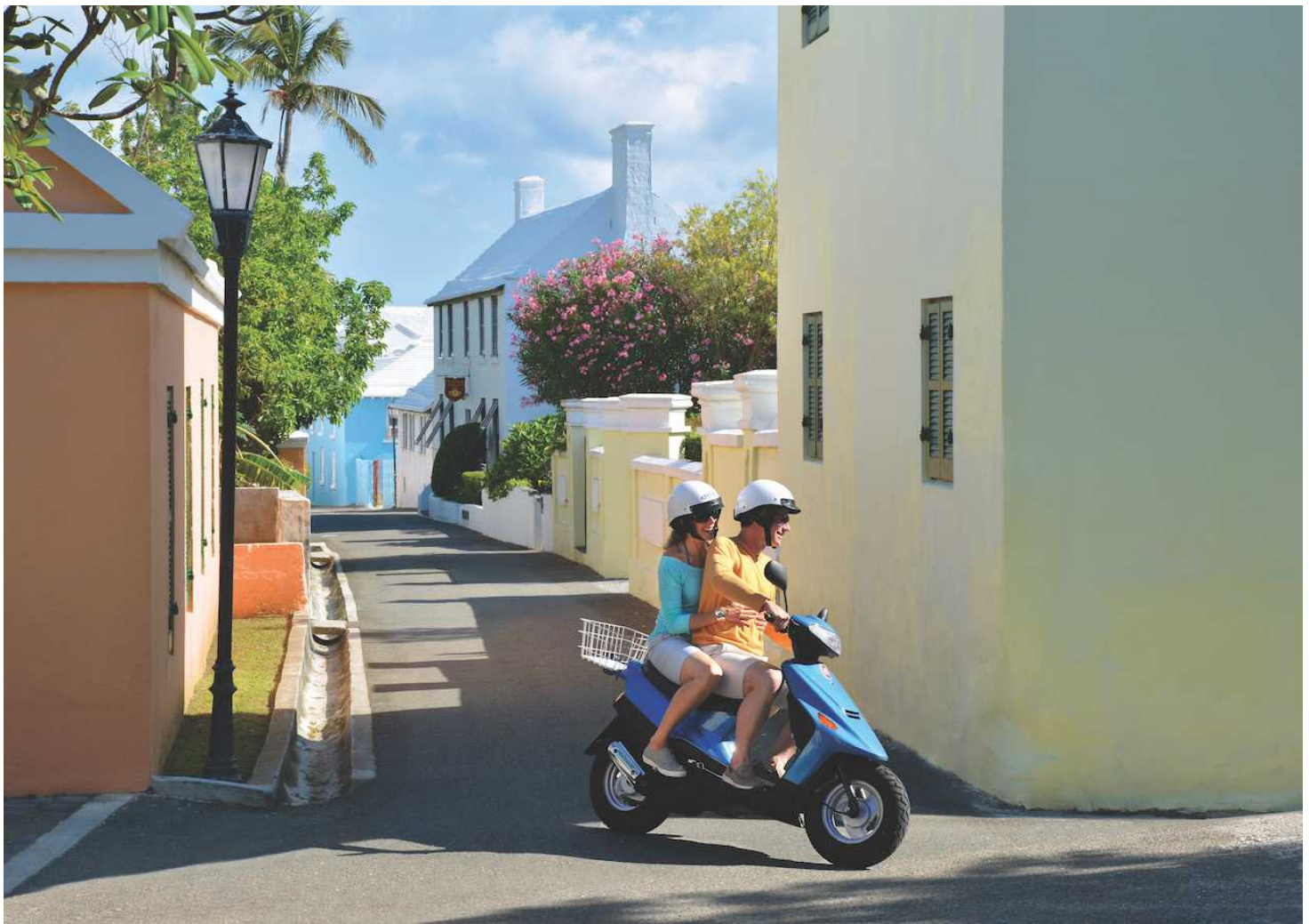
St George's, Bermuda

St George's, in the island's far east, is a UNESCO World Heritage Site steeped in old world charm with its narrow streets and alleyways scattered with quaint old souvenir shops and restaurants.