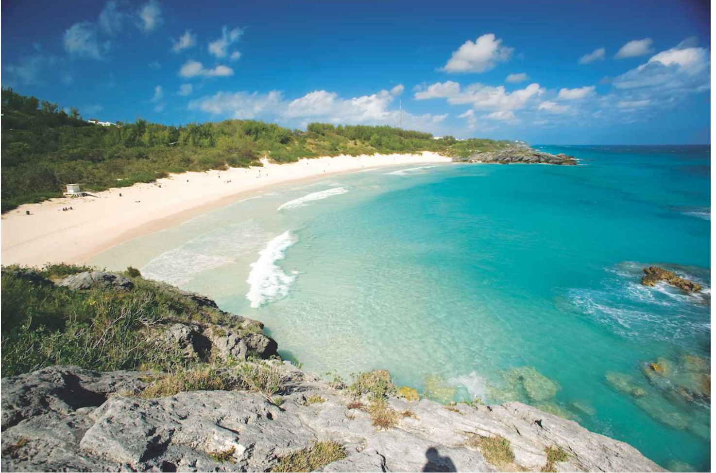
Horseshoe Bay, Bermuda

Then it's off for a couples massage at the idyllic setting of Cambridge Beaches in Sandy's Parish.