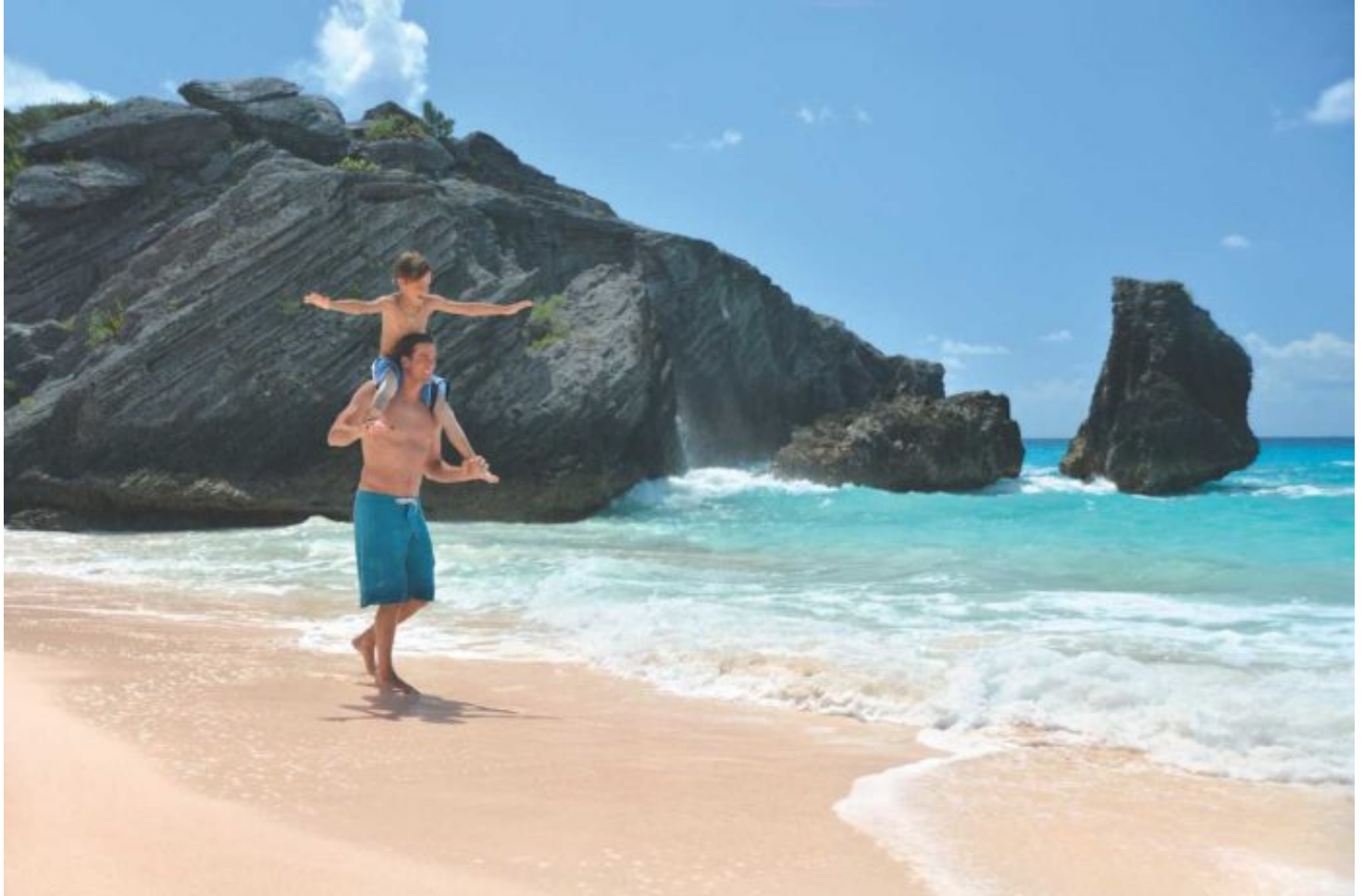
Horseshoe Bay, Bermuda

With its pink sands and golden sunsets, Bermuda is one of the world's truly undiscovered treasures. What's more, this island paradise, which is only 21 miles long and lies in the middle of the north Atlantic, will play host to the 35th America's Cup next summer after seeing off stiff competition from New York and San Francisco.