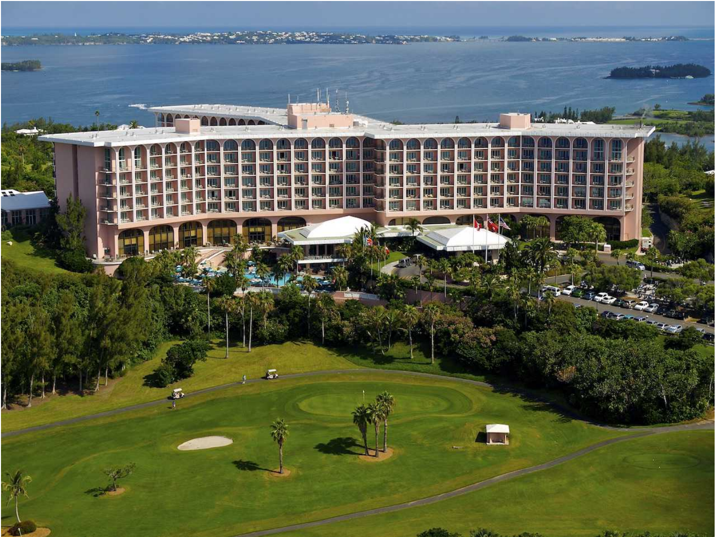
The Fairmont Southampton has rooms from £628 per person during May and June.