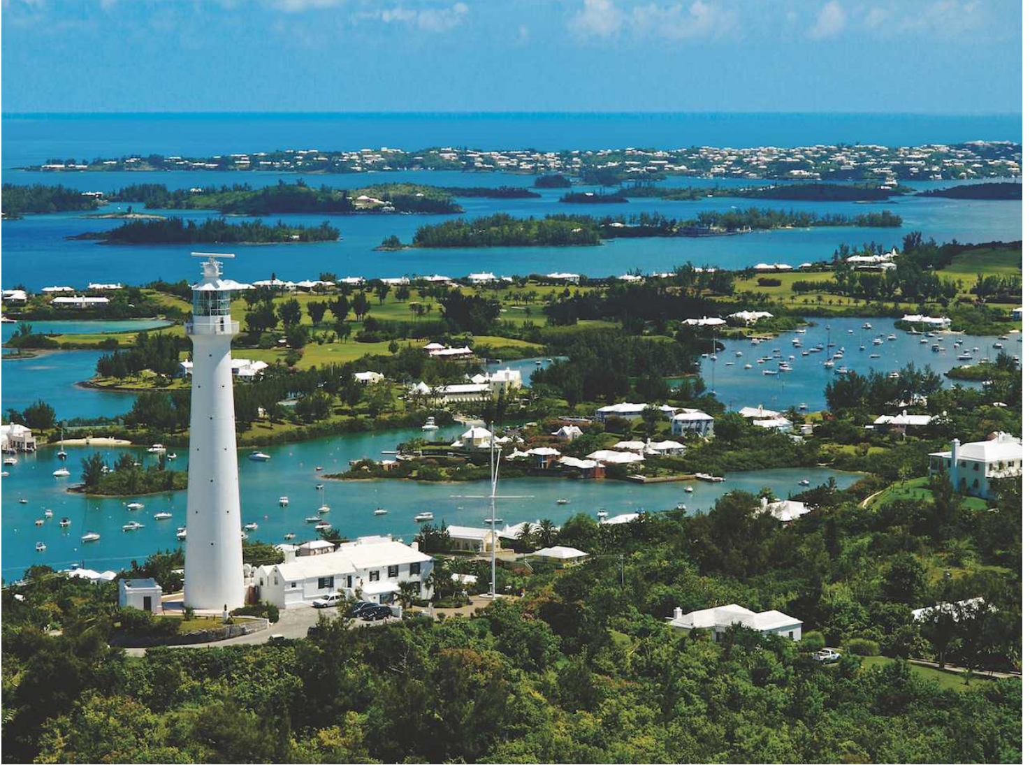
Gibbs Hill Lighthouse, Bermuda

If you fancy a different perspective, make a beeline for the Bermuda Underwater Exploration Institute in Hamilton to learn about the Bermuda Triangle and historic shipwrecks off the island's coast.